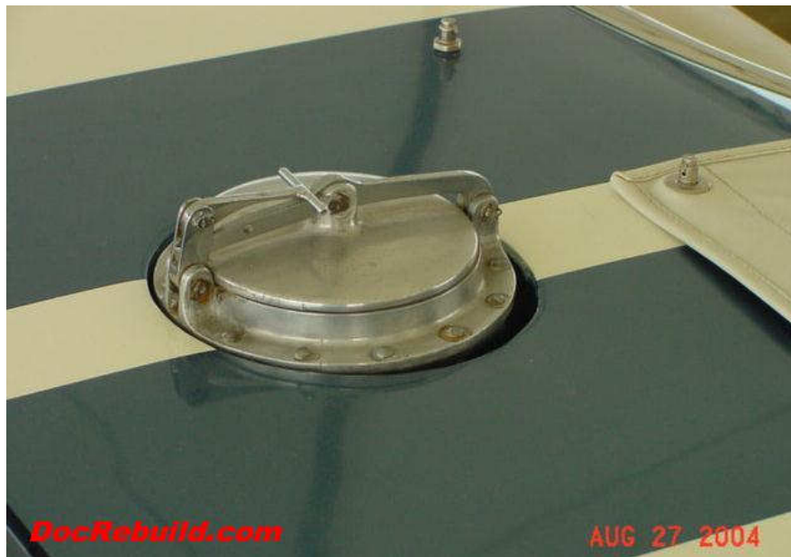
Note large fuel filler in the center of the deck lid.