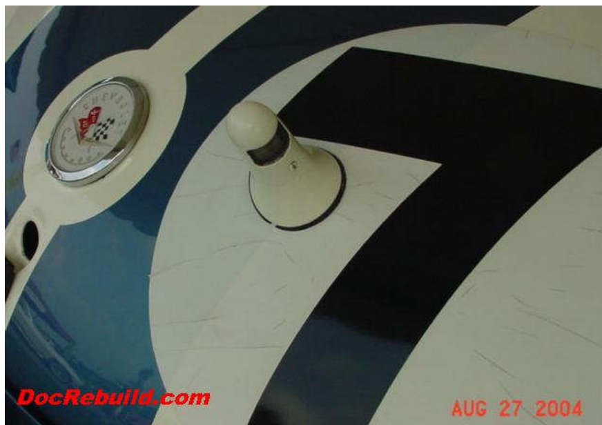
Note the tall "light house" shaped lamp to illuminate the entry number 7 for night racing at the 12 Hours of Sebring. It's a 49-50 Chevy license lamp.