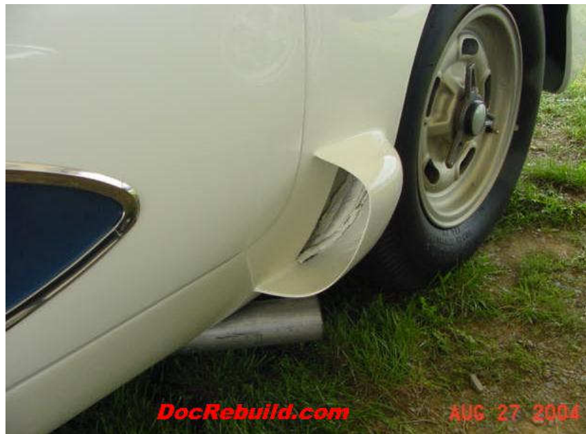
Note the exhaust pipe dump in front of the rear wheels and the scoop for brake cooling.