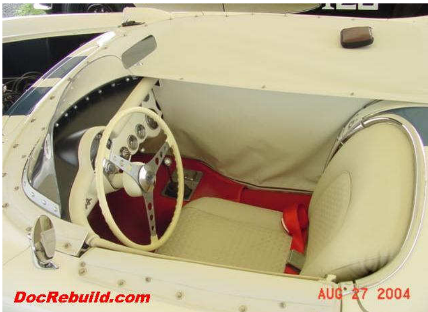
Note the tonneau cover with compartment divider and the snap on covering over the former door glass window slots.