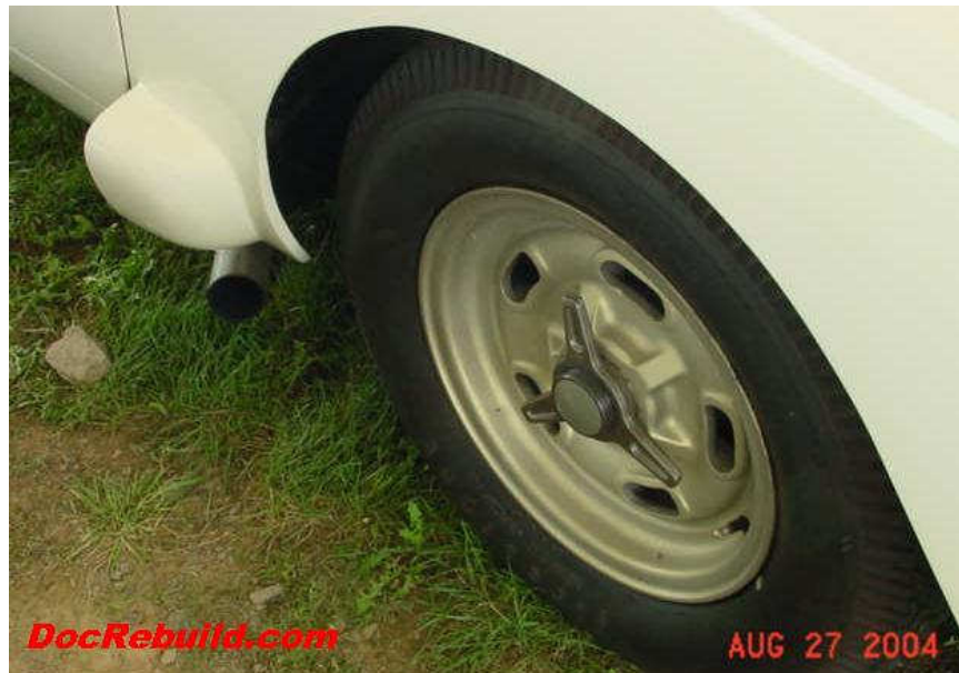
Another view of the exhaust, scoop and the Halibrand KO's.