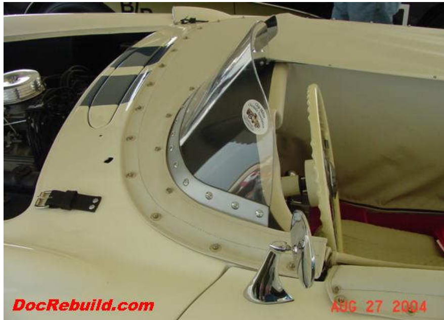
Note the plexiglass wind screen, Guide Y50 mirror and hood leather strap.