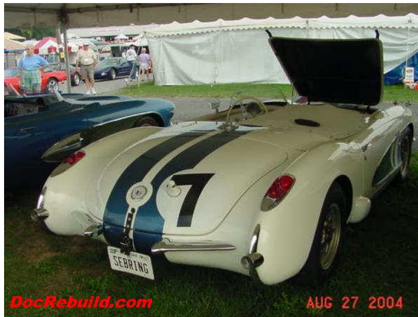
Note the tonneau cover over the passengers seat.