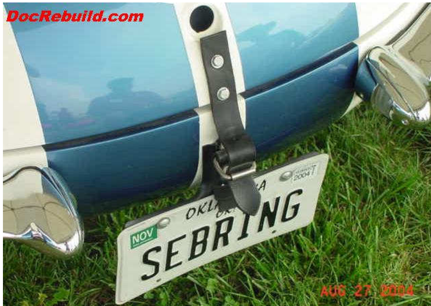
No need for a trunk lock cylinder with the leather hold down strap.