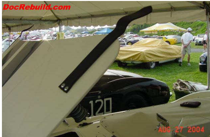
Black leather belts for extra hood security on the hood.