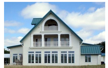
White River Studios