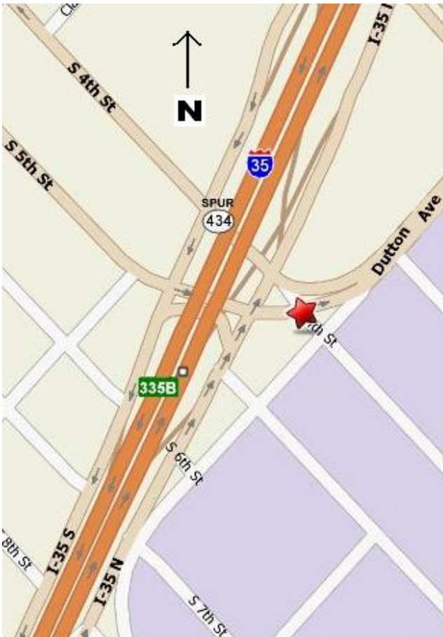
Exit 335, the 4th+5th St Exit. The hotel is next door to IHOP.